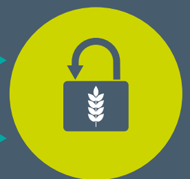
FOOD SECURITY AND NUTRITION